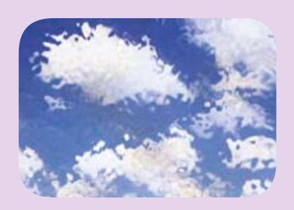
5. Dirt is washed away by rain.