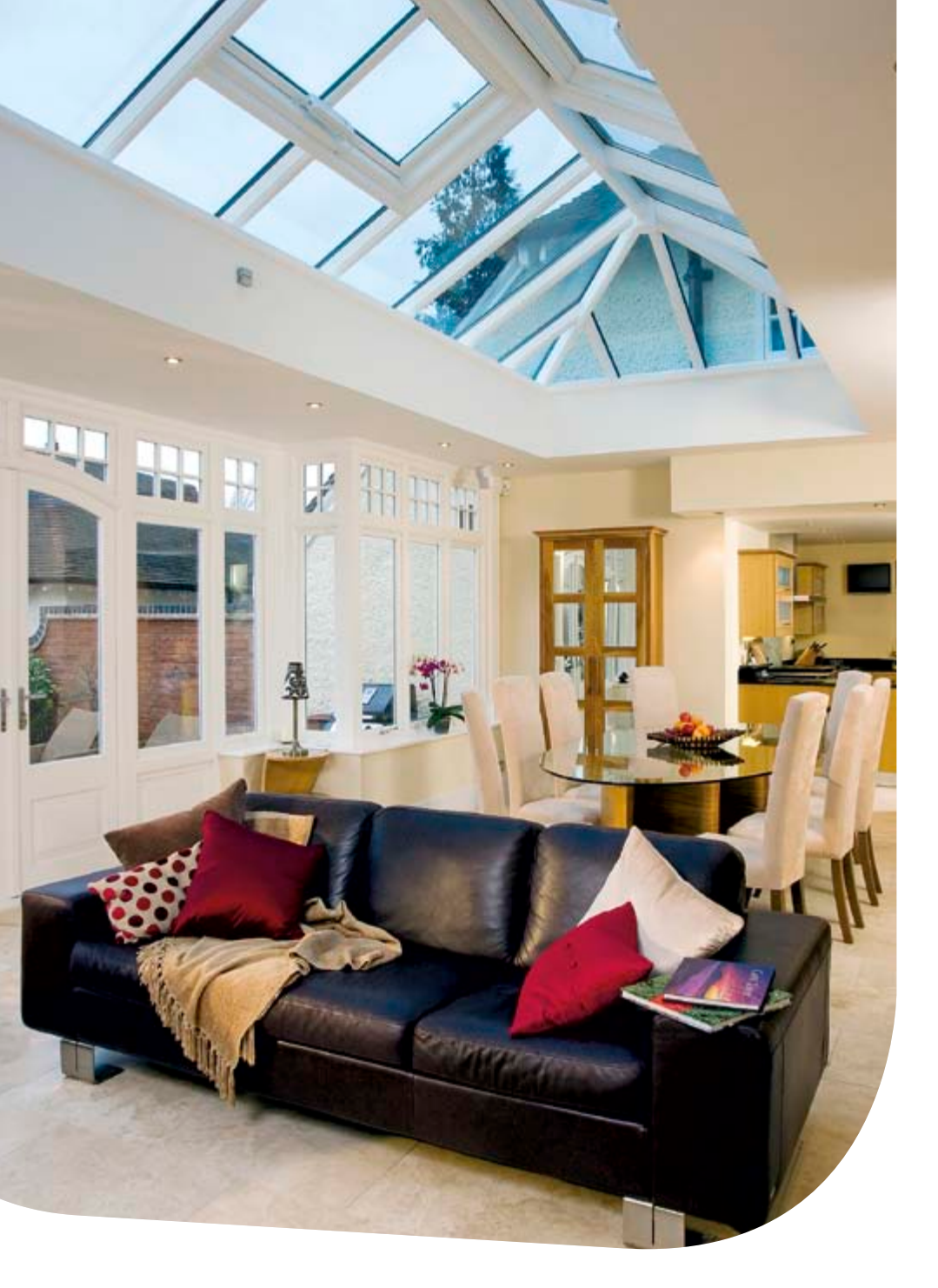
Note: When referring to Pilkington Activ " this includes all products in the range.